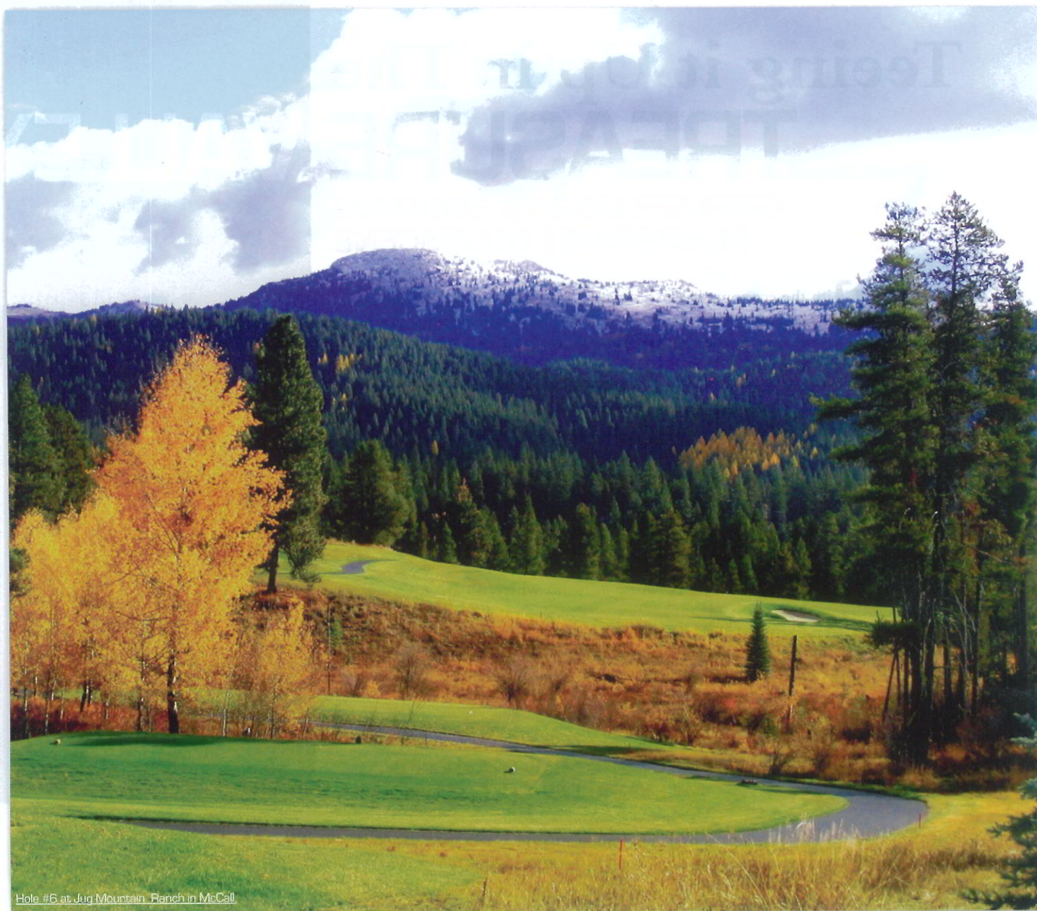
Hole #6 at Jug Mountain Ranch in McCall.

you might carry the ball over the green forcing a very difficult chip shot back to a green sloping away from the player.