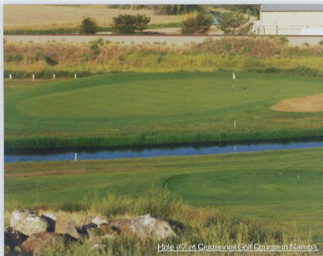
Hole #7 at Centennial Golf Course in Nampa.