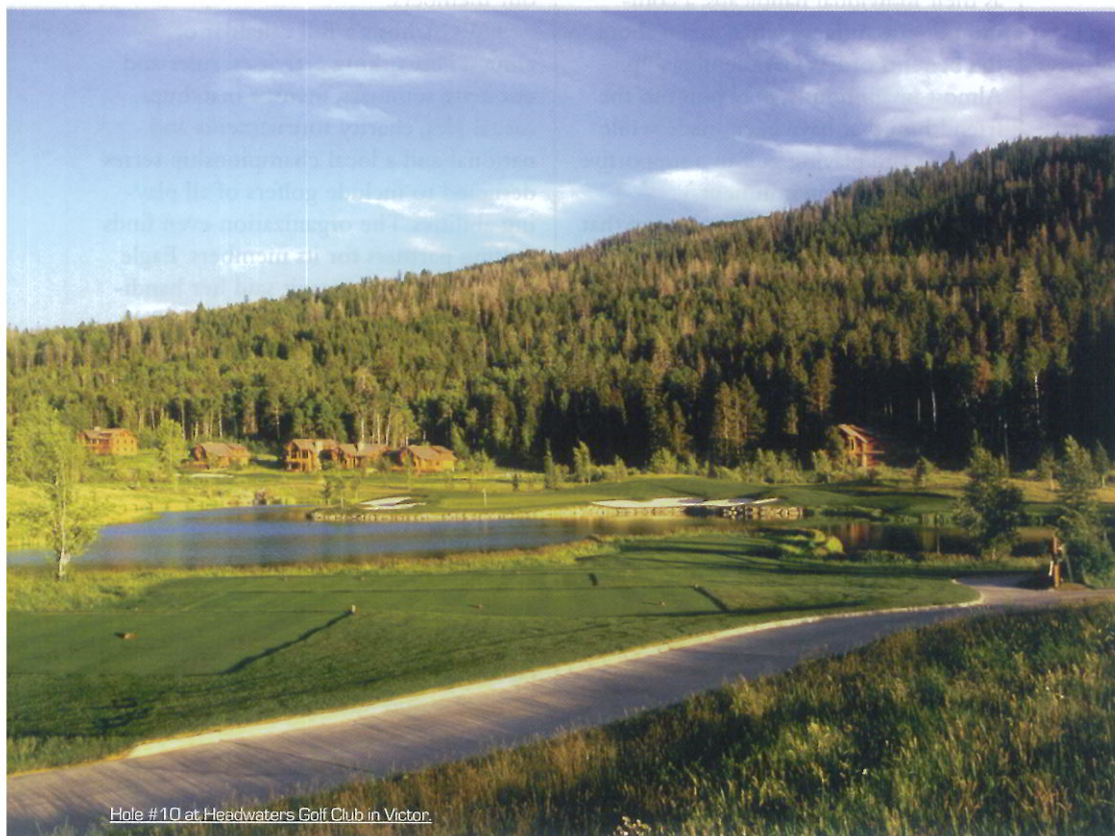
Hole # 10 at Headwaters Golf Club in Victor.

The signature hole at Headwaters is the 10th. With the foothills of the Palisade Mountains providing the backdrop, this relatively short hole provides plenty of challenge. Surrounded by water and sand and with the wind normally blowing across the